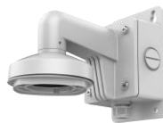
DS-1272ZJ-120B Wall Mount